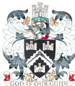
The Worshipful Company of Masons