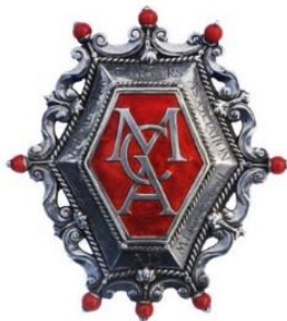
The Master Carvers' Association